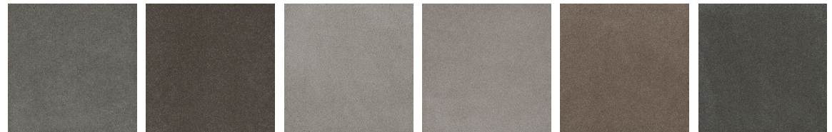
Bay Leaf 2290